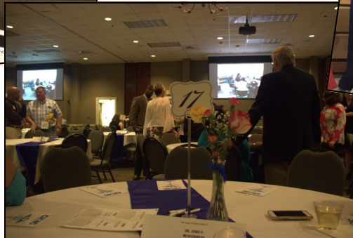
Patrons arrive at the 3rd Annual CHHC Fundraising Dinner